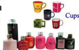
Nail Polish Bottles