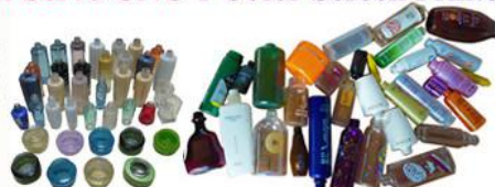
Glass & Plastic Containers/Bottles