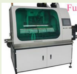
Full Servo CNC 1 Color Screen Printer